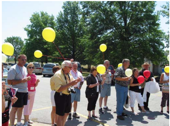
Left: Gifts & memories. Above: Getting ready for closing Sunday.