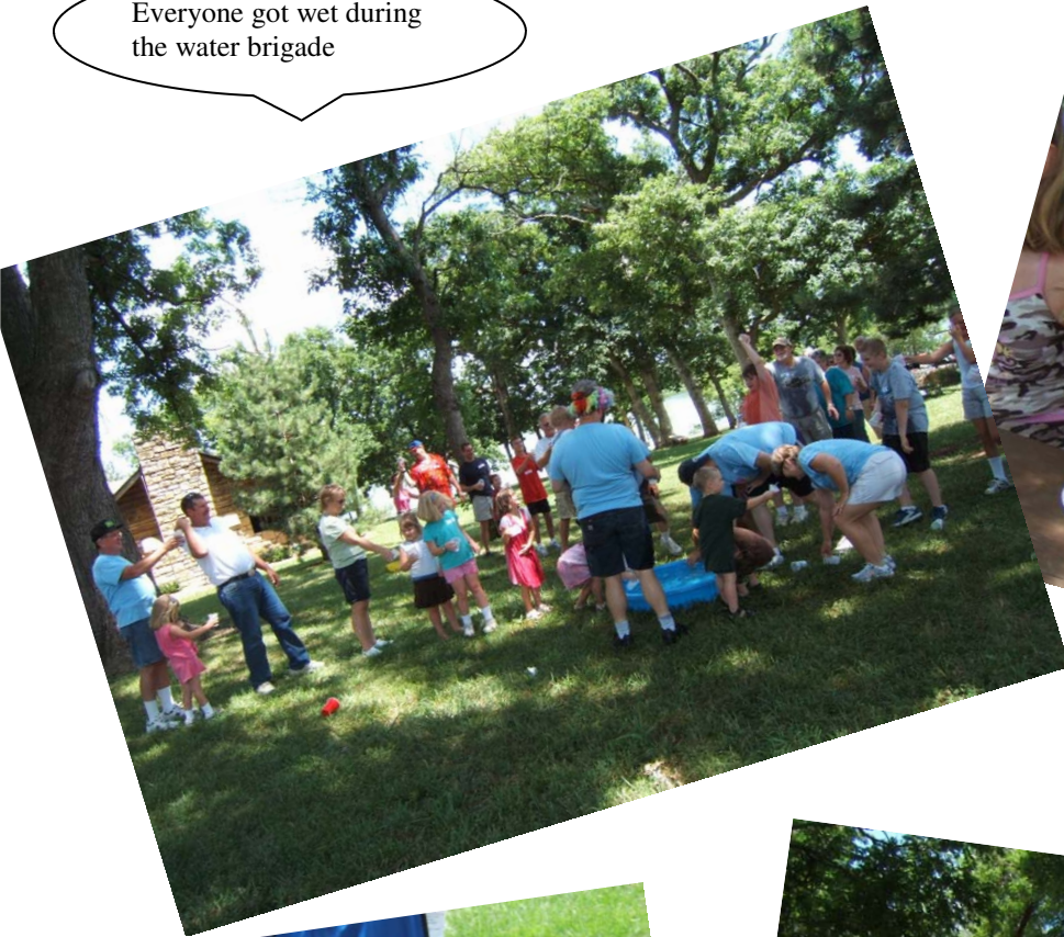
Everyone got wet during the water brigade